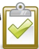
Second expert consultation (31 March – 1 April 2009, WHO Geneva)

Global Conference on Health Promotion (Nairobi, 25-29 October 2009)