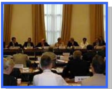
Expert consultation (17-18 Sep 2008, Geneva)